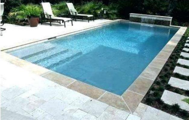
Standard Heated Side Pool (Model 3x-1843 only)