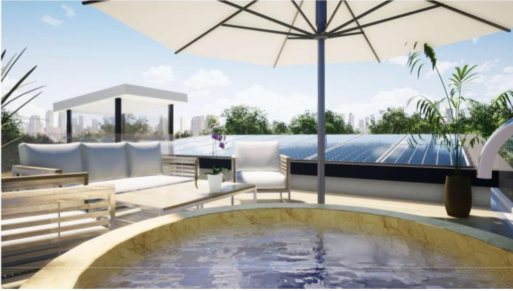
Powerful Solar Roof That's Part of Architecture