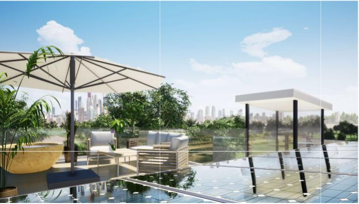
Rooftop Terrace with Standard Architectural Spa