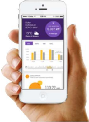
Smart Home Equipped