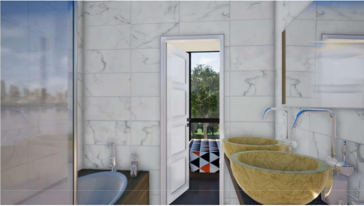
Spa-Style Master Bath