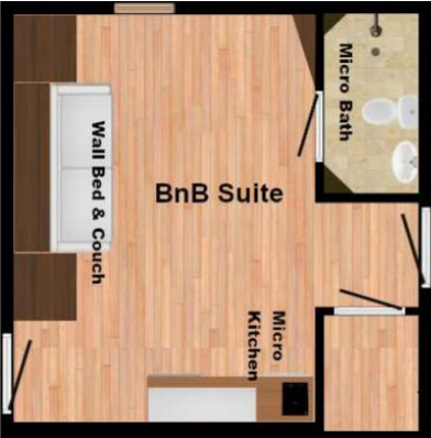
BnB Suite (Model 3x-2068 only)