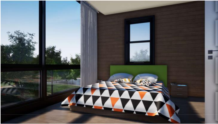
Spacious Master Bedroom with View